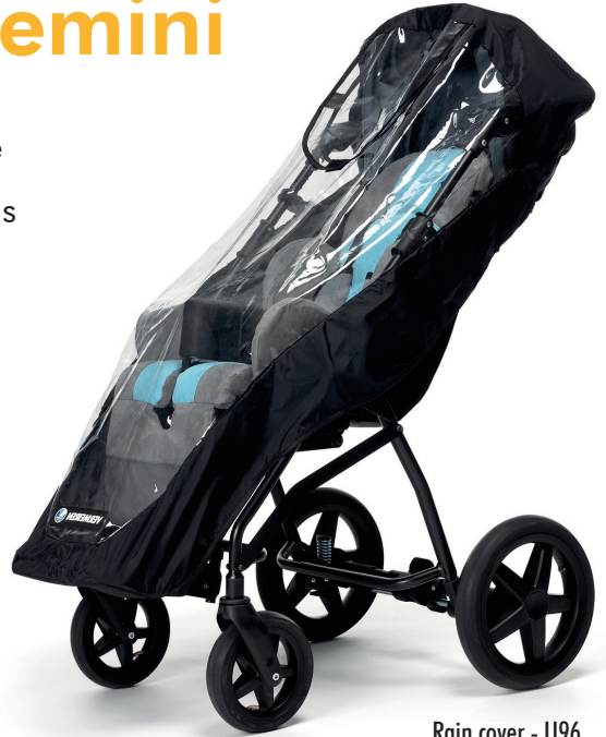
Rain cover - U96