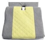
Green & Grey