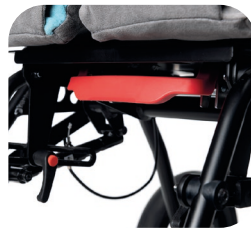
Pull and reverse

The Gemini 2 has been redesigned with compactness in mind, providing easy storage and transport.