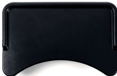
Plastic table - U90