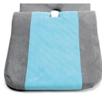
Blue & Grey