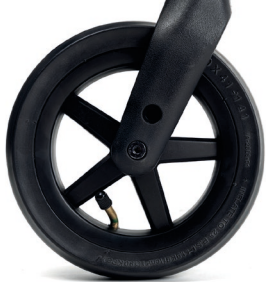
8" Inflatable/PU front wheels