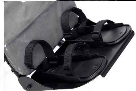
Feet positioning system - U91