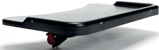
Table - U90