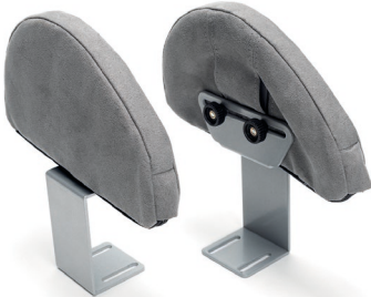
Adjustable hip pellets - U86