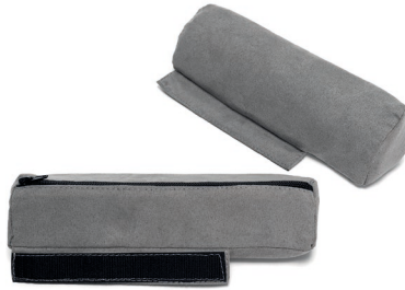
Trunk stabilization profile - U71