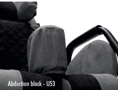
Abduction block - U53