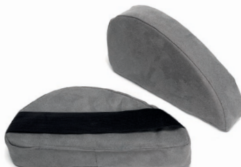
Trunk cushion 2 cm - B28C Trunk cushion 4 cm - B28D