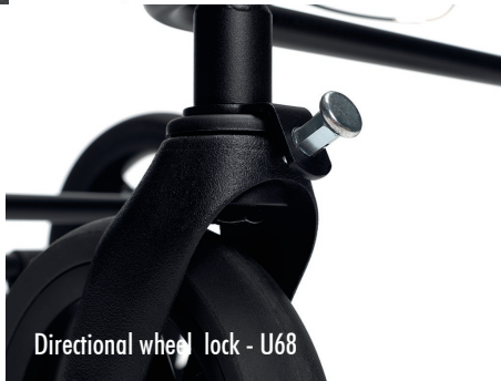
Directional wheel lock - U68