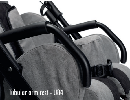
Tubular arm rest - U84