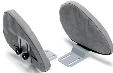
Adjustable trunk pellets - U85