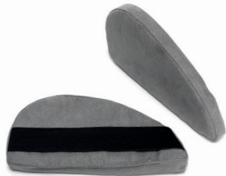
Hip cushion 2 cm - B28A Hip cushion 4 cm - B28B