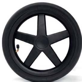
12" Inflatable/PU rear wheels