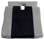
Black & Grey