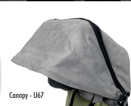
Canopy - U67