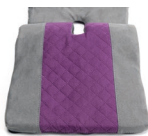
Purple & Grey