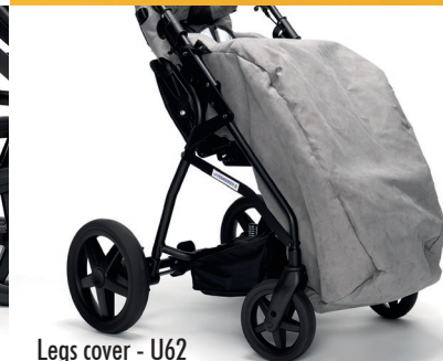
Legs cover - U62