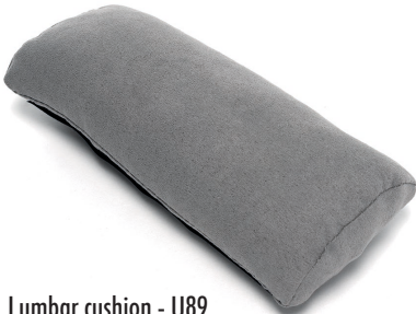
Lumbar cushion - U89