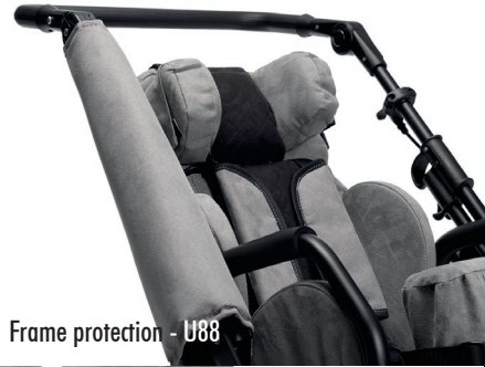
Frame protection - U88