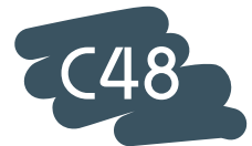
Frame colour: Dotted Dark Grey