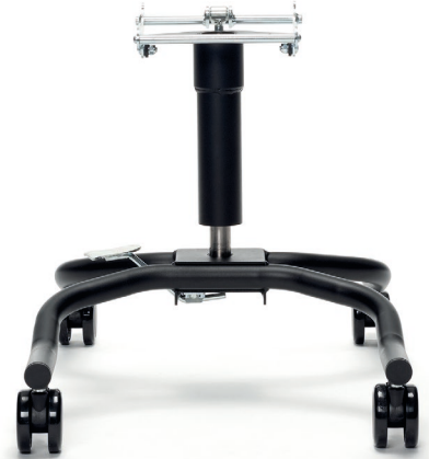
High-low indoor frame - U82