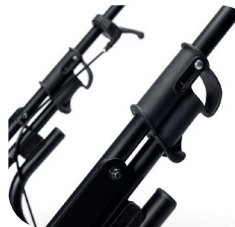
Pull and fold