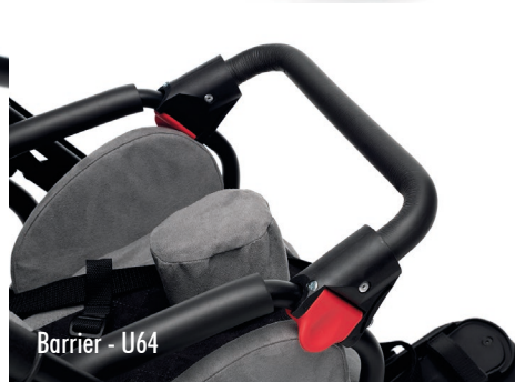
Barrier - U64