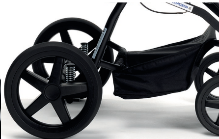
Shopping basket - U61